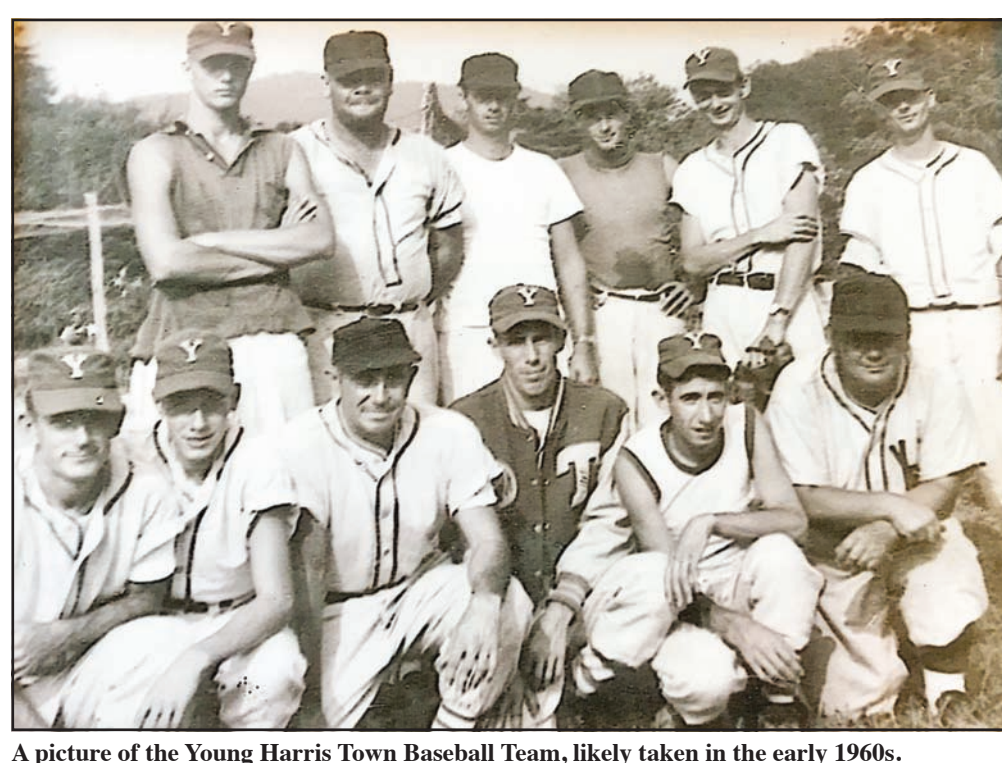
A picture of the Young Harris Town Baseball Team, likely taken in the early 1960s.

He was the first umpire in Dixie Youth Baseball history to be selected to officiate games in the Dixie Youth Boys and Majors World Series – an honor historically reserved for host town umpires - in Rock Hill, South Carolina, in 1987.