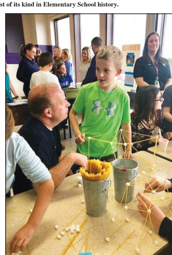
Approximately 170 students and their families attended the

Despite drawing more than 25 percent of the student body and putting nearly 400 people into the cafeteria, the school hopes to improve on its Family Math and Science Fair in 2020.