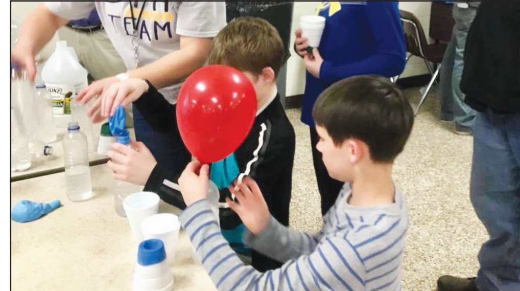
The March 26 Fair was the first of its kind in Elementary School history.

And each student received a coupon that they could use at any time, in math or science only, to raise their lowest grade to 100.